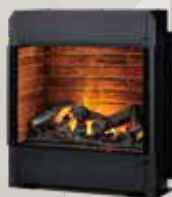
Brick back panel