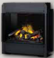
Mirror back panel