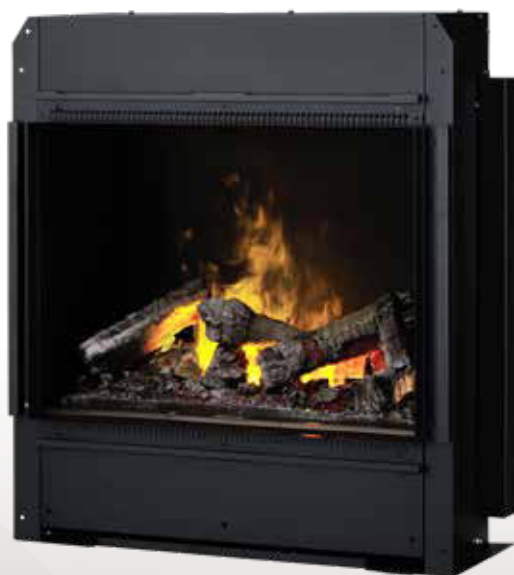
Engine 56-600 (black)